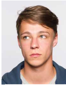
Dont look away from camera ✗