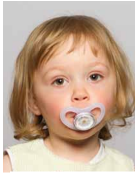
No dummies ✗