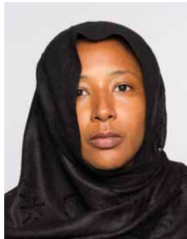
Avoid covering face ✗