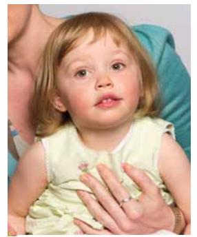
1 person only in photo ✗