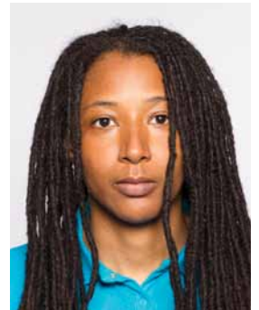
Keep hair off face ✗