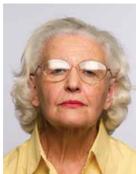
No glare on glasses ✗