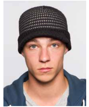
No fashion hair covering ✗