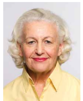
Don't smile ✗